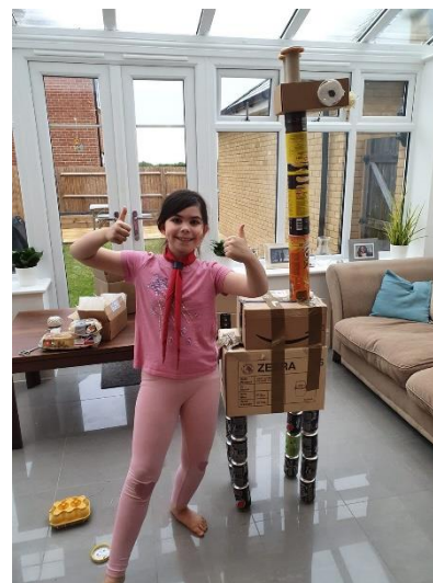
Making giraffes in lockdown!