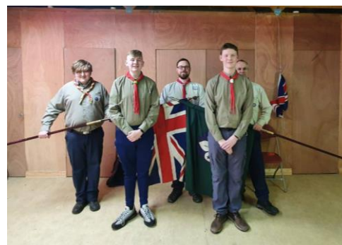
Our Young Leaders