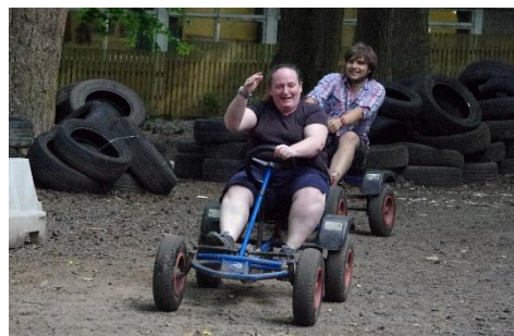
It's not just the kids that have fun at summer camp!