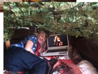
Virtual camp night