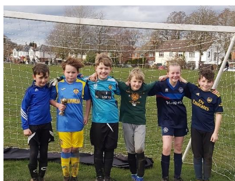
Our 6-a-side team who took 2nd place at the District Competition #soproud!