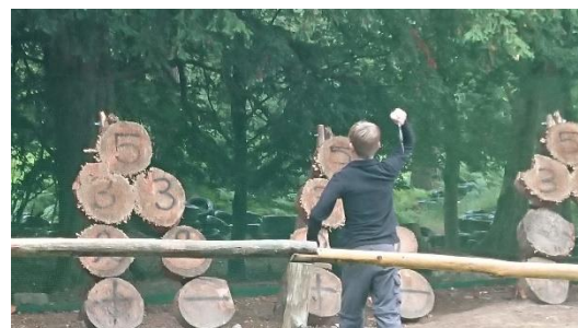
Axe throwing while on camp

Summer Camp was held at Broadstone Warren. This included various activities like Axe Throwing, Climbing, Swimming and Water Zorbing to name a few. They also did the cooking and washing up (so no excuses for not doing it at home) and learnt Knife and Axe which required them to understand safety rules for use and storage, demonstrate how to use properly to gain a certificate of use. Even if Luke did try and cut his thumb and finger off with an axe.