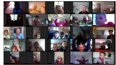
Online scouting via Zoom!

The COVID-19 outbreak and lockdown has meant that face to face meetings were suspended in March, affecting the Scouting that we could offer to our members. Undeterred our Leaders rose to the challenge and invited our members to do so too. We ran online meetings almost the very next week and have a real success with Beavers, Cubs and Scouts all joining in. Our leaders have had to learn new skills to do this and I can say that there is no less effort that goes into an online meeting as there is in a physical one. We have managed to use the online Scouting to help members earn badges and even posted them out. We decided quickly that we shouldn't be collecting Subs this last term but to ask for donations instead. Thank you to everyone that made donations via our PayPal giving.