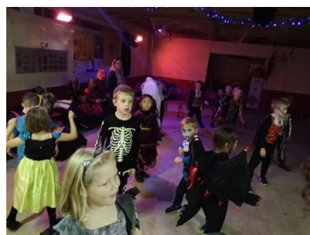
Beaver's Halloween party

The groups work together, and the Beavers have earned many badges while having fun along the way. Some examples of our joint events are: Hallowe'en party, Remembrance Parade and going to the Church of the Good Shepherd to complete our Faith badges. We have also participated in the District trip to Paulton's Park and joined the entire unit at the Panto in December. We had a sleepover and a visit to the F.A.S.T. Museum scheduled, but unfortunately these have been cancelled. We were impressed that almost all Beavers participated in Camp at Home.