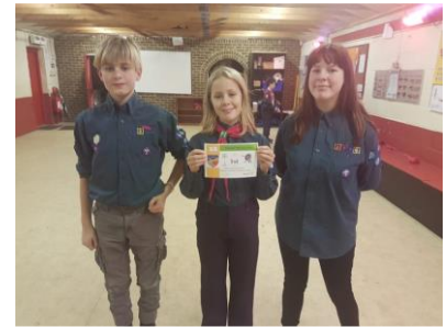
Winners of the Scouts Marksman competition

In addition to the regular section meetings the young people of the group have also taken part in district events like the swimming gala, sleepovers, 6-aside, Mastermind, carol services, incident hikes and more; including winning the Scouts Marksman competition.