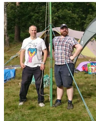
Skip and Bear